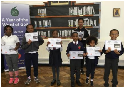
Our wonderful Gifts from God Children